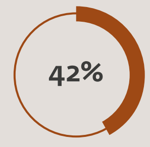
indicated that English was not their first language.