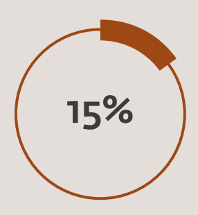
had a learning difficulty or disability