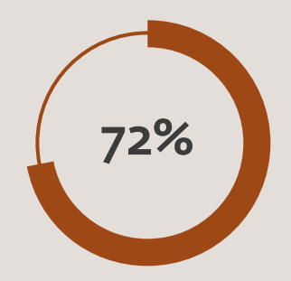
were unemployed at the start of their course